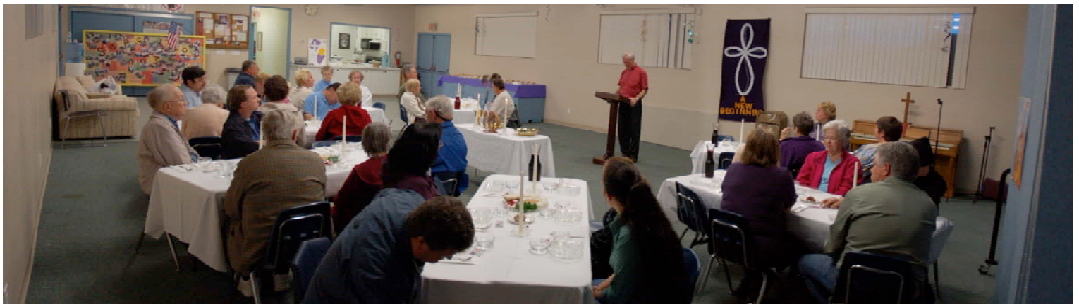
Sadar Meal on Maundy Thursday