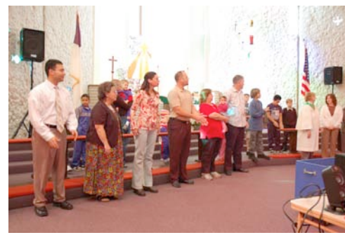
New 2007 Council