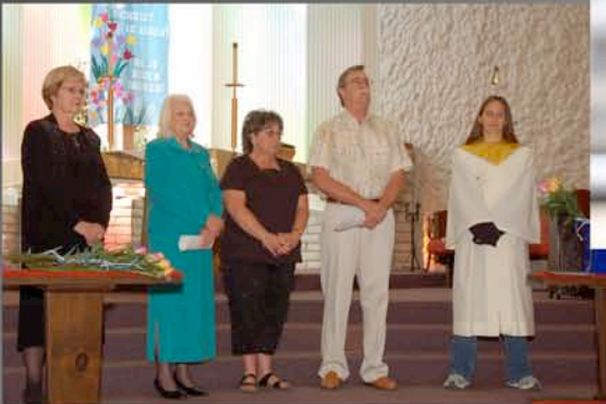
New Stephen Minister's