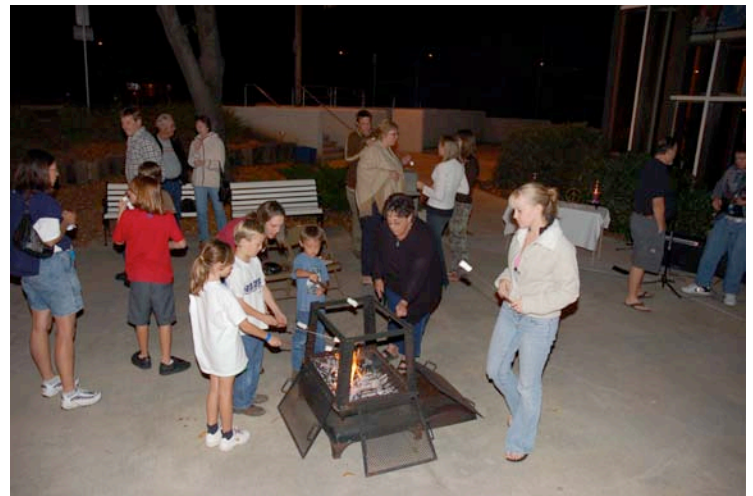
Second Worship Service