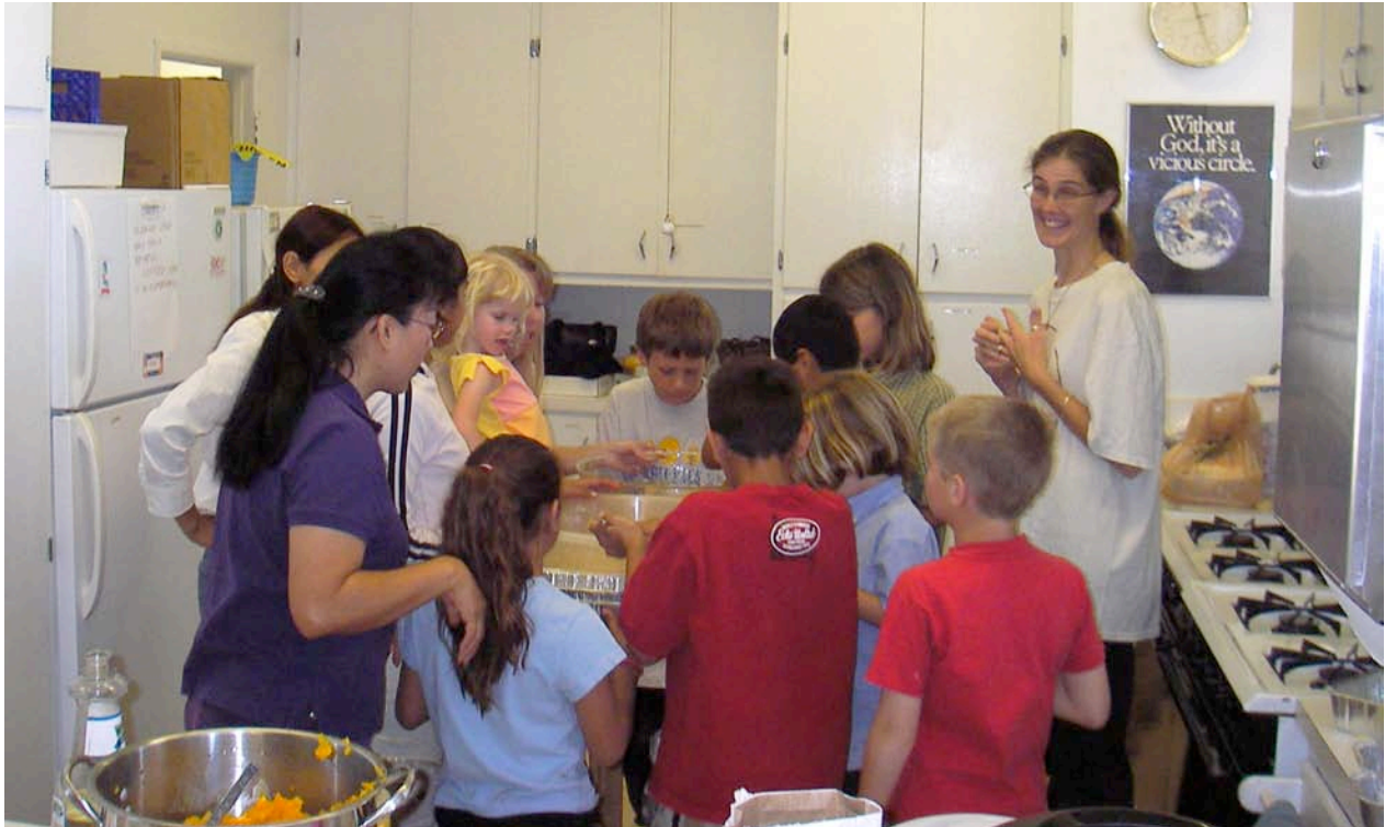
Sunday School making pumpkin bread

(If anyone was missed, please call the church office, 448-1888)