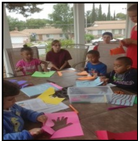
These campers are cutting out hands for our Irish rainbow bulletin board.