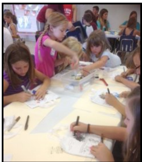
Campers creating and designing totes to carry items back and forth.