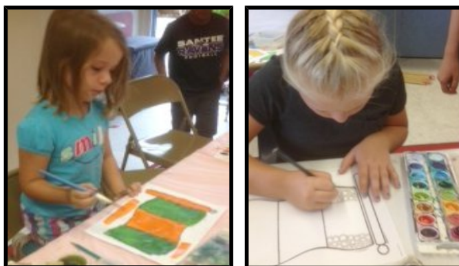
Campers painted flags from the different countries.