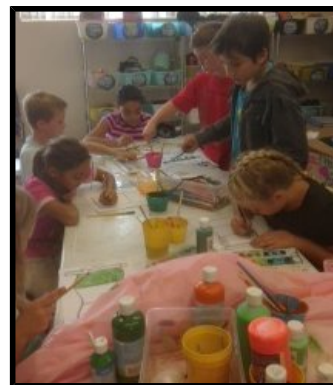
Painting is always a camp favorite!

This summer we moved around the world and visited 15 countries in 15 days! Each day there was a bible verse attached to the country information sharing as well as an arts and crafts activity. Five groups of 9-10 campers each rotated between media, creative arts, arts and crafts, chimes, minute to win it, around the world knowledge, group time and Godly cooking and dance. There was worship every morning and afternoon and lunch with the seniors. The performance on July 24th was one of the best ever! Thanks to all who donated their time and money to support our camp ministry.