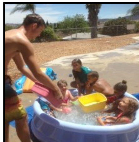
Every Friday the campers had fun with splash day activities.