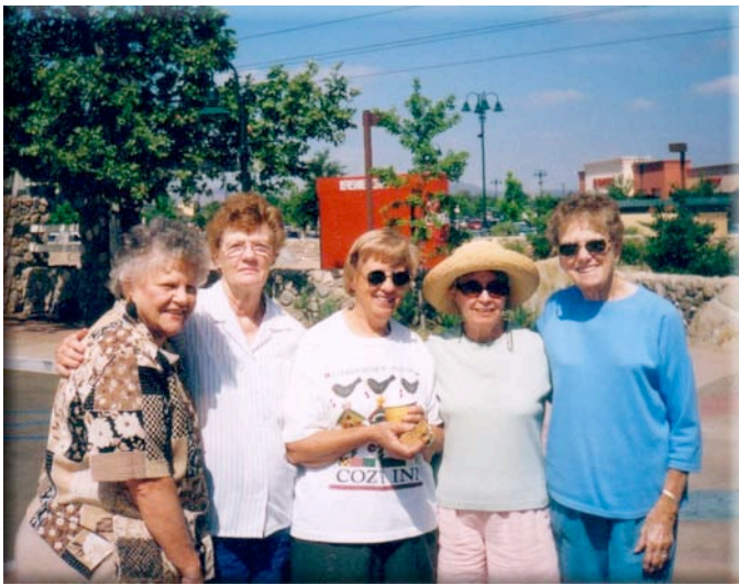
Tuesday Fellowship @ Einstein Bros Bagels